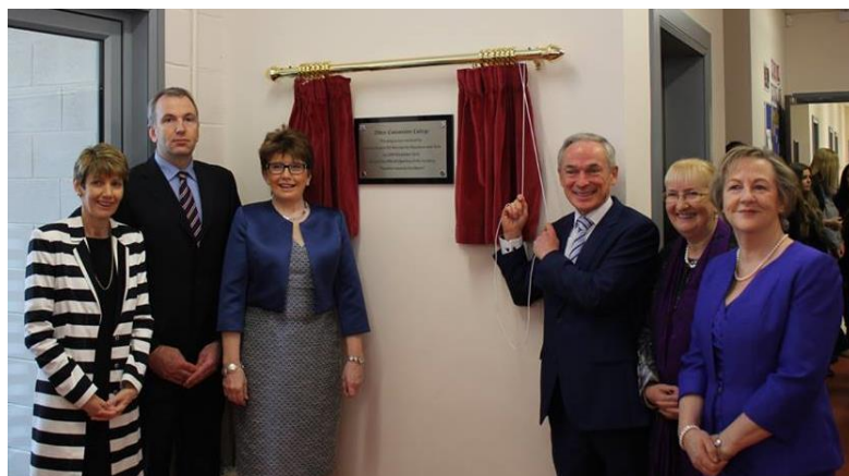
The Official Opening of Abbey Community College extension

The PPP project to deliver the two new schools on the Carlow campus progressed with building work advancing throughout 2016. This project is due for completion in January 2018.